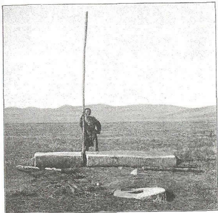
Die ursprüngliche höhe des monumentes.